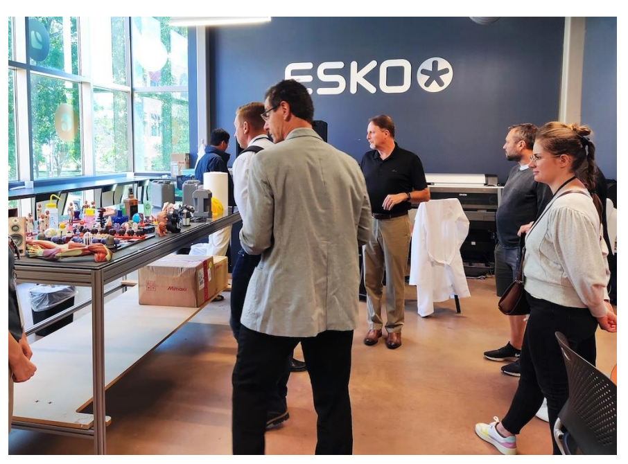
iarigai/IC attendees visiting the Sonoco Institute at Clemson University

The visit continued with a tour at the Godfrey Hall, the home of Clemson's Graphic Communication Department.